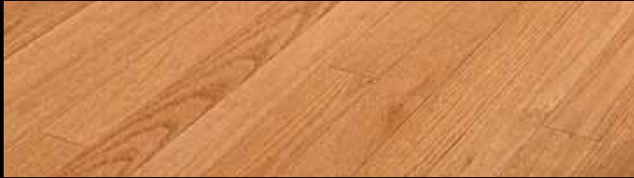
Canyon Oak - HS1003 (also available in HP3003)