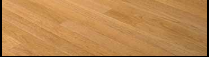
Saddle Oak - HS1002 (also available in HP3002)