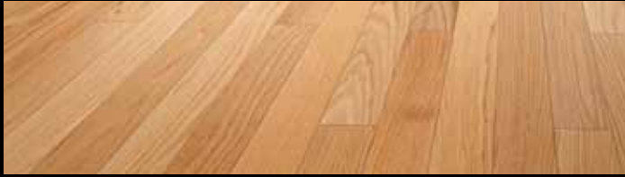
Natural Red Oak - HS1001 (also available in HP3001)