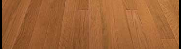
Sienna Oak - HS1004 (also available in HP3004)