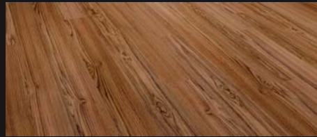
Panama Teak - J37887