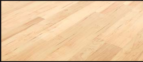
Summerside Maple - J37467