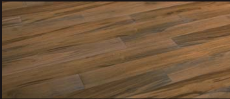
Trenton Walnut - J37873