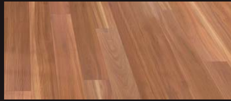
Pandora Plum - J37642