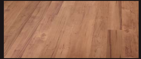
Augusta Cherry - J37661