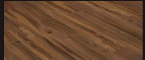
Hartland Maple - J37892