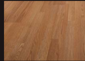
Colonial Oak - L37874