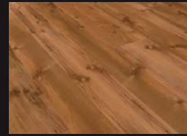
Cherry - L37485