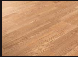
New Haven Oak - L37330