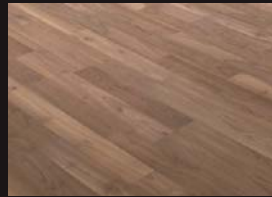
Ashland Hickory - L37673