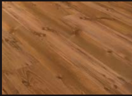
Spruce - L3346