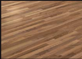
Bedford Walnut - L37652