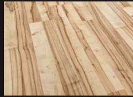
Rustic Maple - L37479