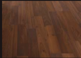
Rockford Hickory - L37671