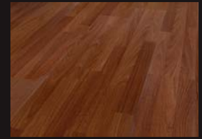
Jatoba - L37615